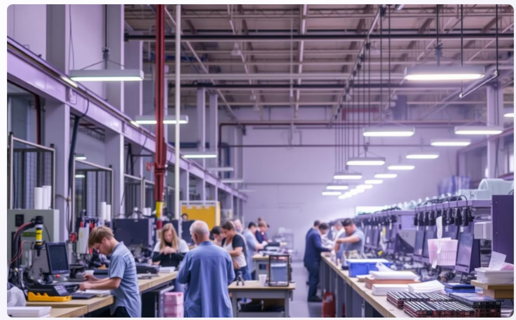
See how the certificate has helped MSMEs achieve financial stability and growth.